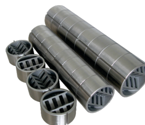
A system of slots and pins assures correct assembly of the mixing elements of the melt blender.

Contact us, and we will propose the best solution for your machine...!