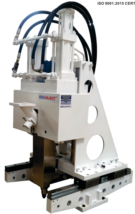
VERTICAL INJECTION UNIT

Complete solution for multi-material & multi-colour moulding. Easily adaptable, converting 1K injection moulding machine to 2K. Injection units available in vertical, horizontal & inclined configurations, driven hydraulically or electrically. Customised rotary platens in hydraulic & servo electric available. Common power source for injection unit and the rotary platen. Compatible with varied processes of core -back, rotary & cube moulds. Universal Euromap 67 interface. Proven yet affordable technology, at par with global standards. MADHU's hands-on expertise in tooling and moulding processes an added benefit.