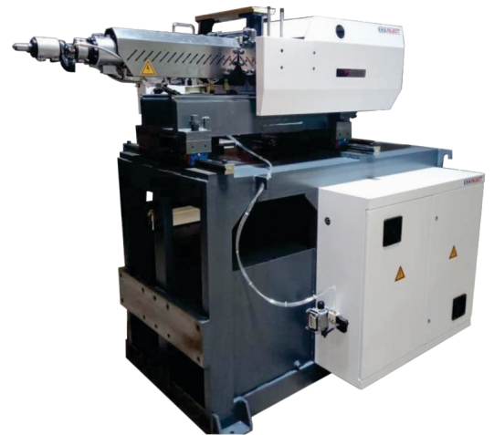
HORIZONTAL INJECTION UNIT